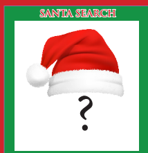
IMAGE HIDDEN INSIDE OR OUTSIDE